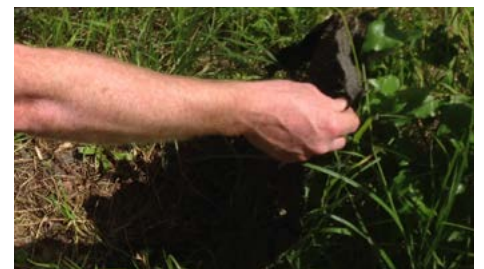
^ Tiles provide an attractive resting place for reptiles.