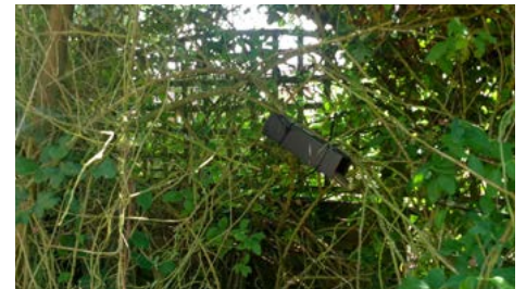
^ Day shelters for dormice are placed along the route to help assess the whether dormice are present.

Network Rail has awarded Parsons Brinckerhoff a contract to carry out timetable modelling, the design and alignment of track, civil engineering works to bridges and embankments, geotechnical investigation and survey works and studies on how the reinstated railway will impact on level crossings, station design, consents, ecology and environmental works. Building on the work already completed by the East West Rail Consortium and Network Rail, this is a significant milestone for the East West Rail scheme because it will enable the project to be developed to the point where the contract for detailed design and construction can be awarded.