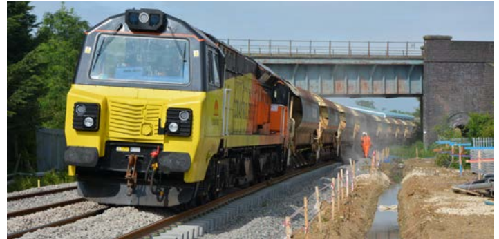
^ Chord construction nears completion with the extension of the chord culvert. An engineering train delivers ballast for the chord construction.