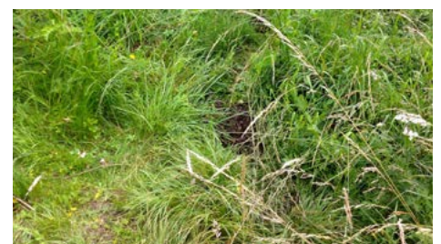
^ Trampled grass and burrowing indicate the presence of badgers.